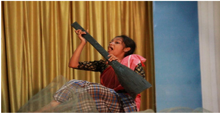
Matsyagandhi - a performance