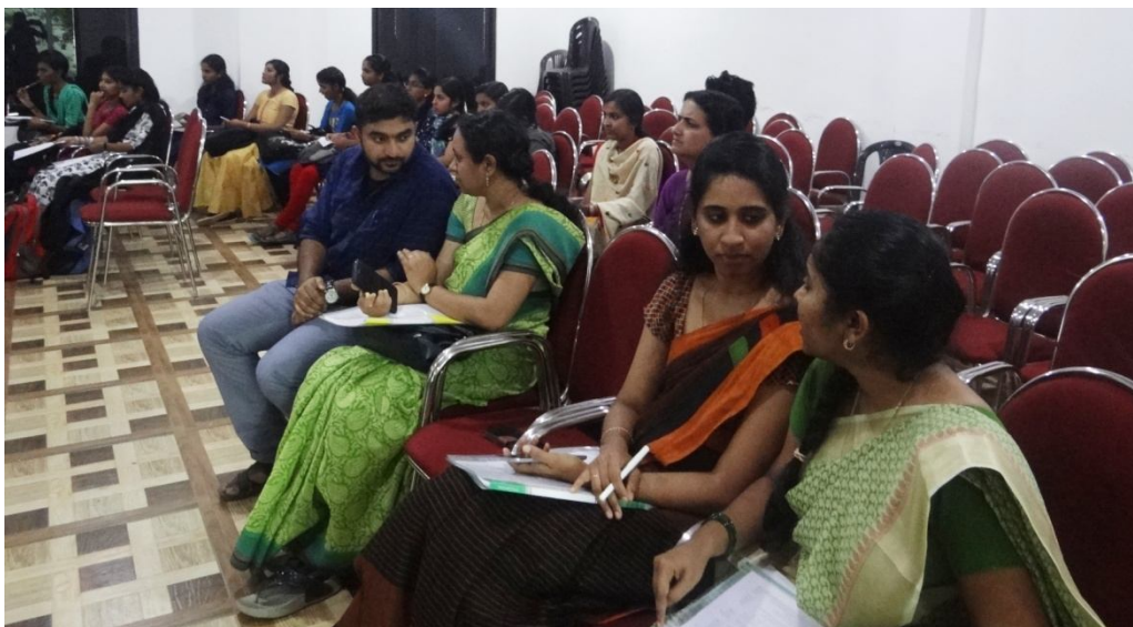
Internal mentors looking on the performance of their mentees.