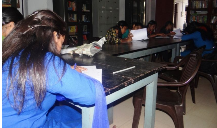
D2 Mentees attempting mock test