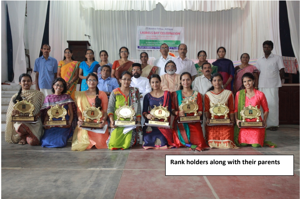
Rank holders along with their parents