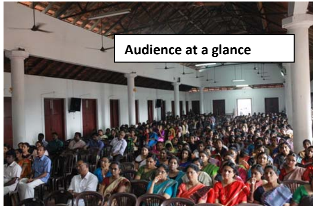
Audience at a glance