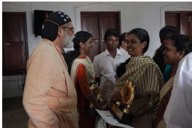
Manager speaking with the candidates and their parents after the function