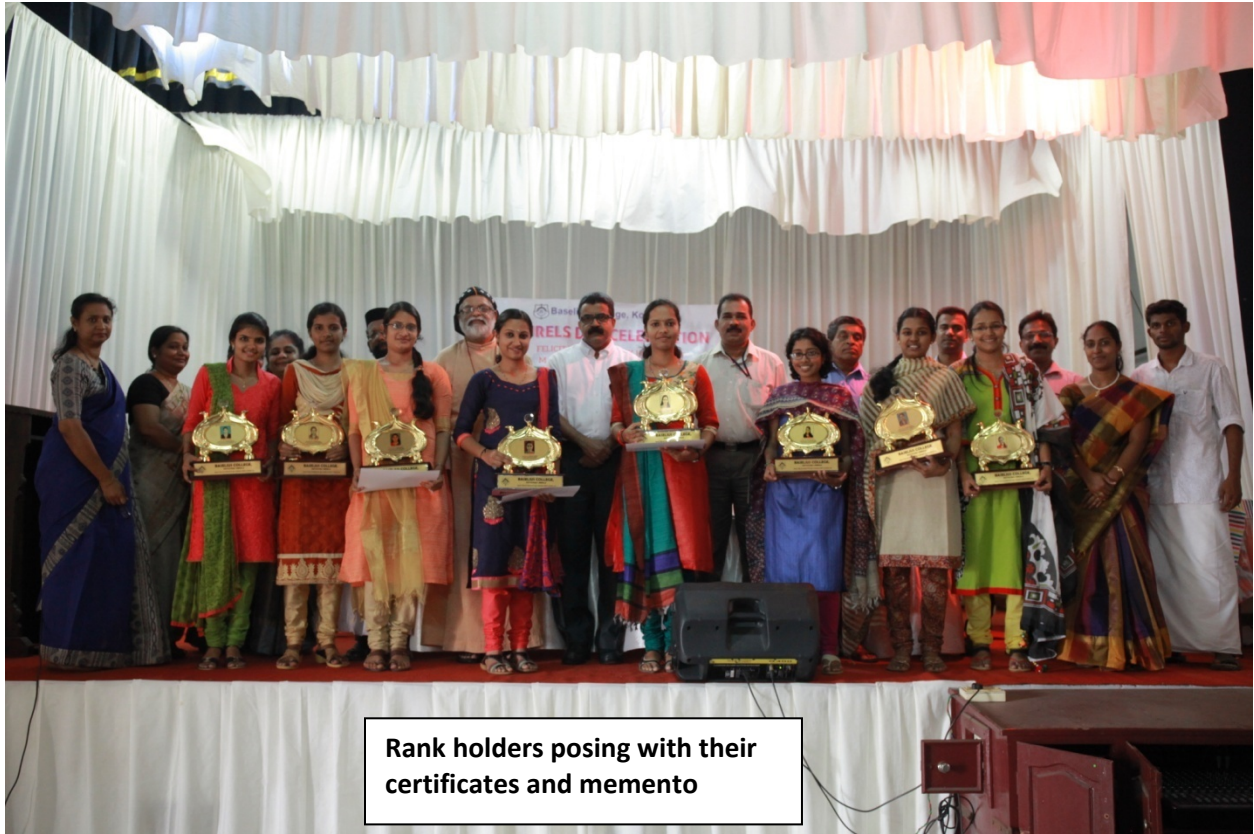
Rank holders posing with their certificates and memento