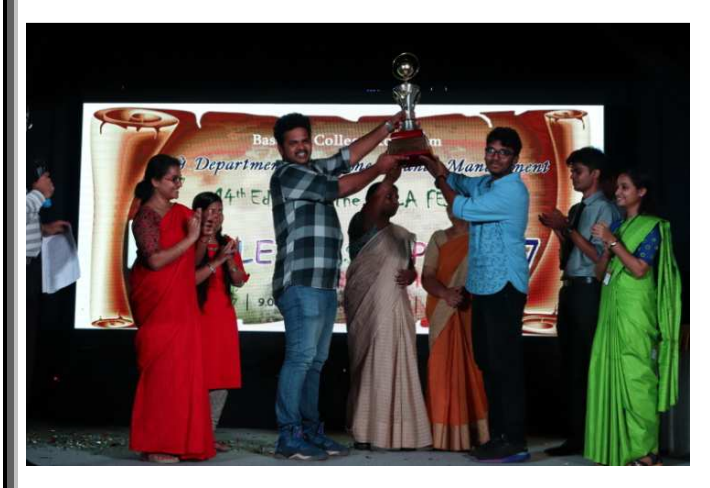
Overall Champions: K.G College, Pampady.