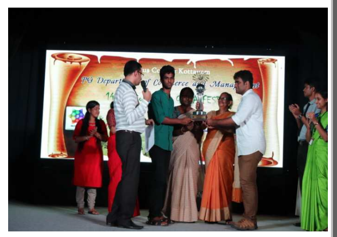
Runners Up: St. Thomas College, Pala.