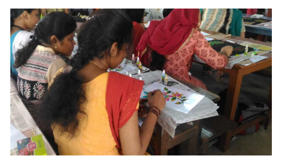
Students engaged in glass painting during the Pidilite painting class