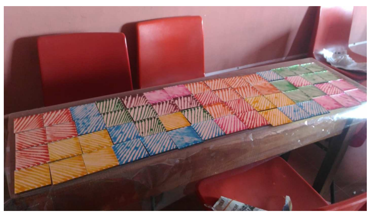
Kaleidoscope stage setting preps