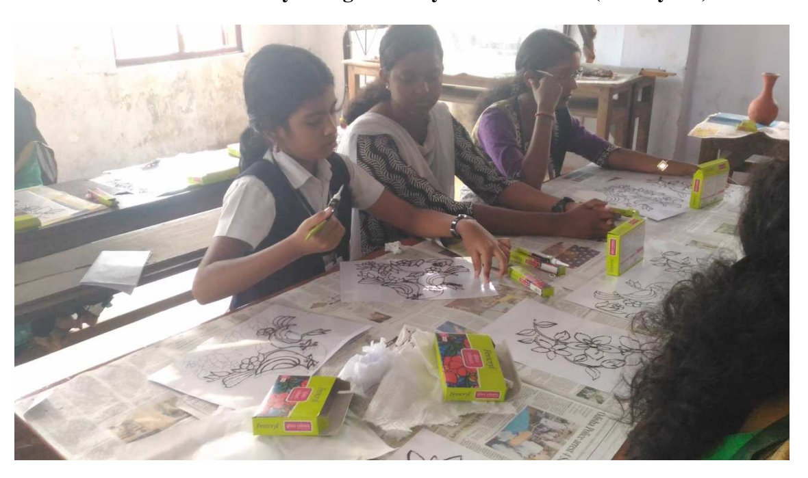
Painting class organized in association with Womens forum