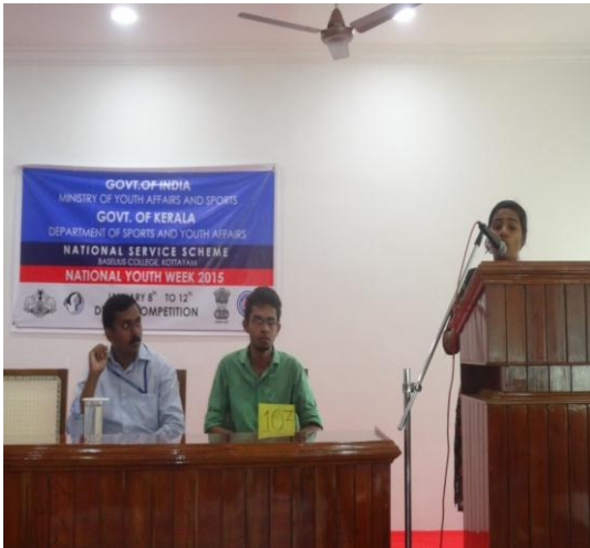
National youth week in collaboration with NYK