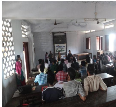
Vihaan support centre –Aids awareness