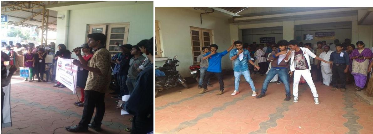
AROGYAPACHA (Waste Management Campaign)