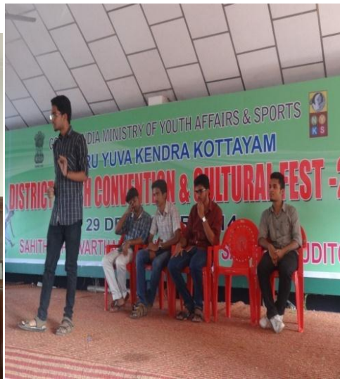
NYK Youth Convention