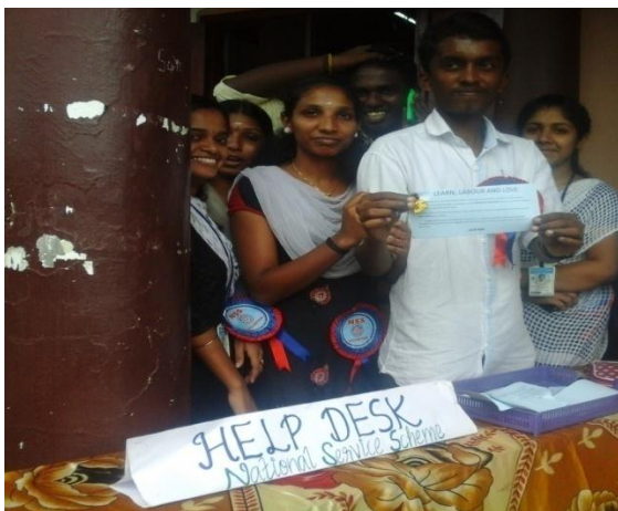
Help desk on D1 COMMENCEMENT DAY and anti ragging cell.