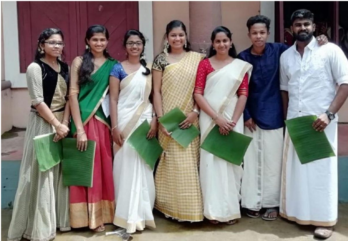
Chemistry Association won Third Prize in Onappattu Competition

#interdepartment #Kabadi #Runners up #CHEMISTRY 🥳❤️