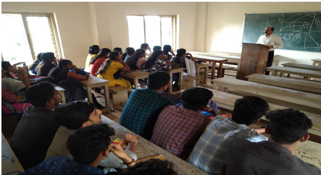
One day Seminar on KAS organised by Career guidance cell in association with Kerala State Yuva Jana Shema Board , Kerala State higher education council and IT department