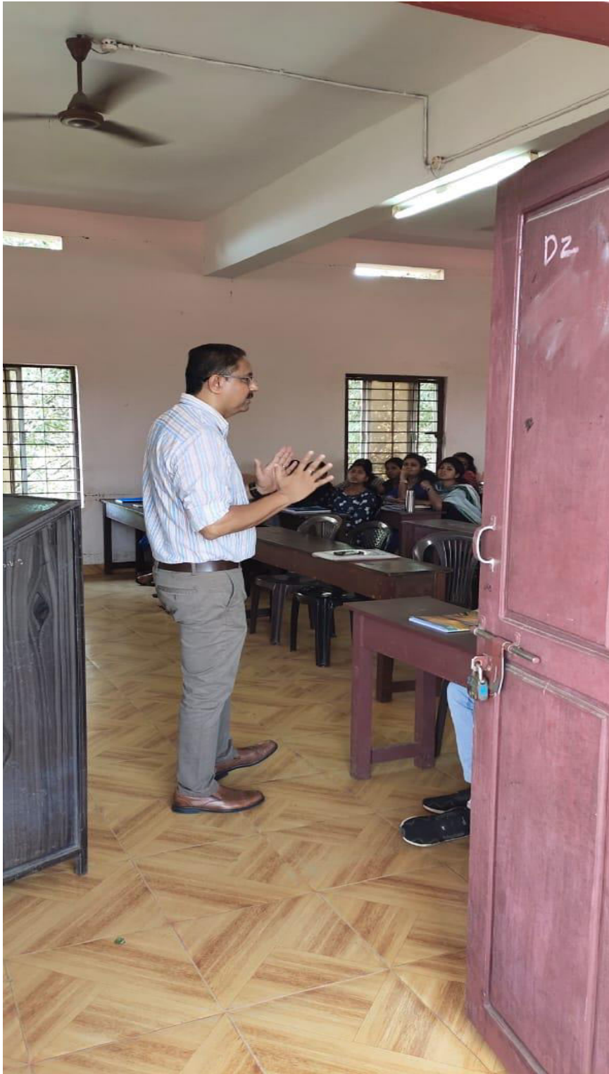
KAS orientation for PG Students