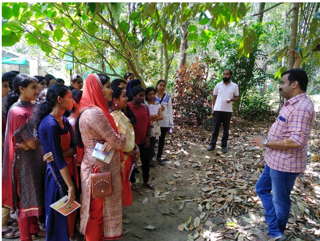
Visiting Plant Conservatory at MSSRF , Puthoorvayal, Wayanadu

A field visit was conducted on 31.1.2019 to 4.02.2019 with our D3 students to MSSRF, Puthoorvayal, Wayanad, Mysore and Belur as part of curriculum. Students collected plants from the rural vegetation and preserved it for haerbarium preparation. They also got an opportunity to see many plants in the field that were known to them earlier only through names. They received a class from the scientific staff of MS Swaminathan Research Federation, Puthoorvayal, Wayanadu regarding the various activities of the institution, why and how it established etc. Later students visited the premises of MSSRF with special emphasis to conservatory and tissue culture Laboratory. Dr. M. V. Krishnaraj, Prof. Arabhi P. and Mr. A M Varghese were accompanied the study tour.