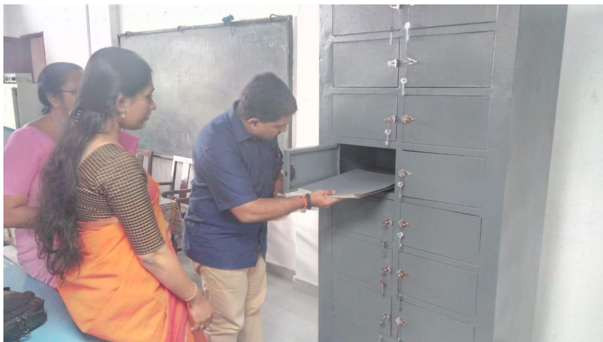
Handing over of Herbarium cabinet by 1990-93 BSc. Botany batch