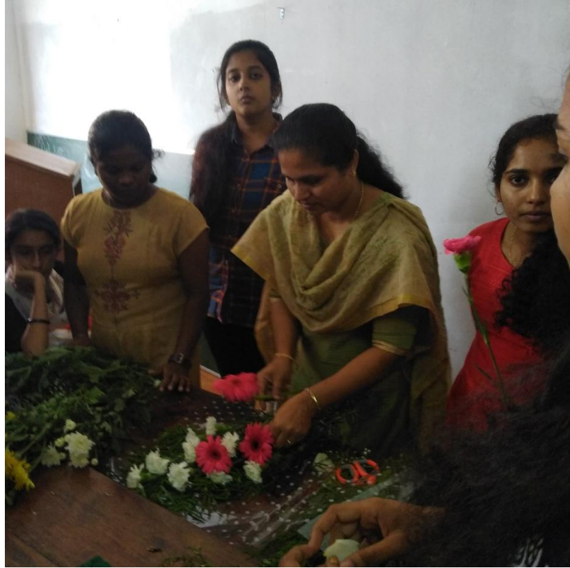
Demonstration by the resource person