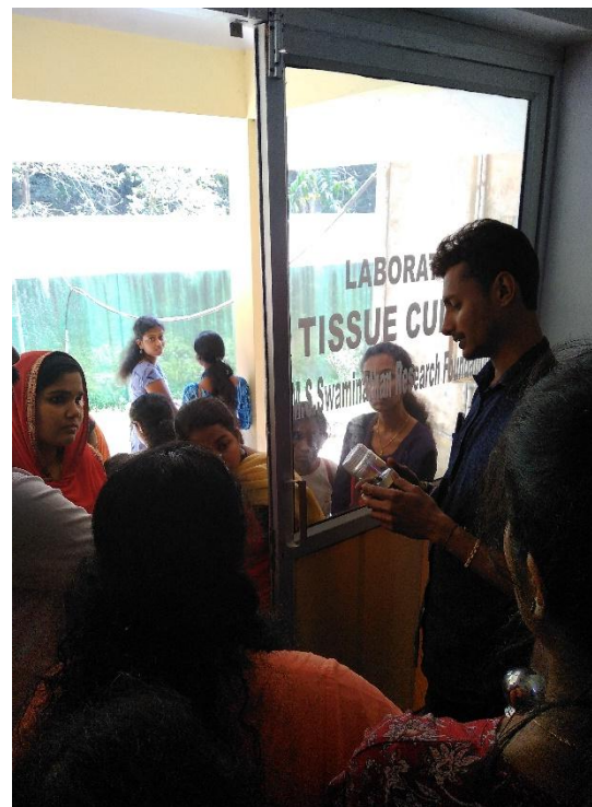
Visit to Tissue Culture lab at MSSRF, Puthoorvayal, Wayanadu