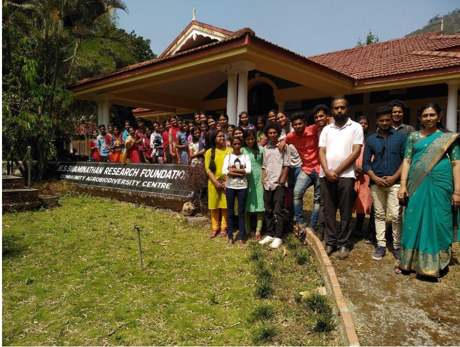
Final year students (2016-19) in front of MS Swaminathan Research Foundation, Wayanadu